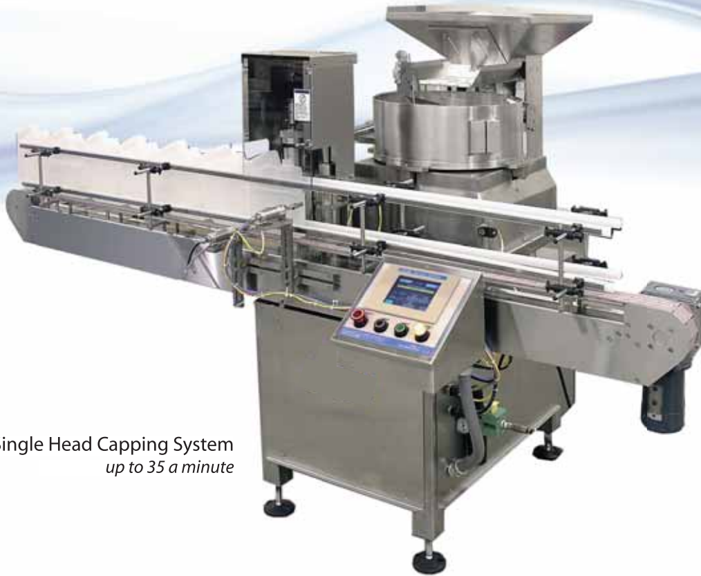
Single Head Capping System up to 35 a minute