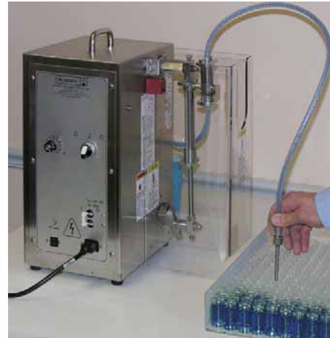
AB Series Medium Duty Benchtop