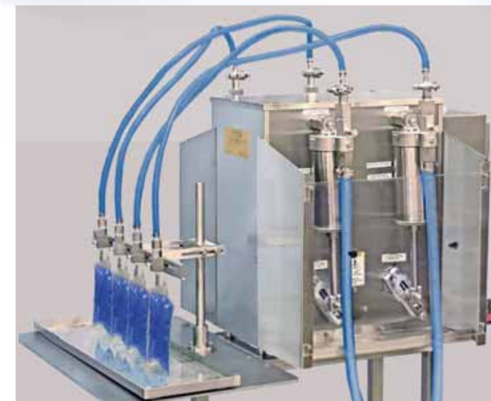
DAB Series Heavy Duty Benchtop

Filamatic offers FREE product testing to determine which liquid filling solution is best for you. We provide purchasing options that fit every budget, including rentals and lease arrangements. We even have a "Try Before You Buy" program to ensure complete satisfaction.